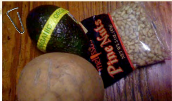
Avocado, Pine Nuts, Jicama

In weeks it will root, in a few months you'll have a dramatic house plant, in a few years - a new pineapple!